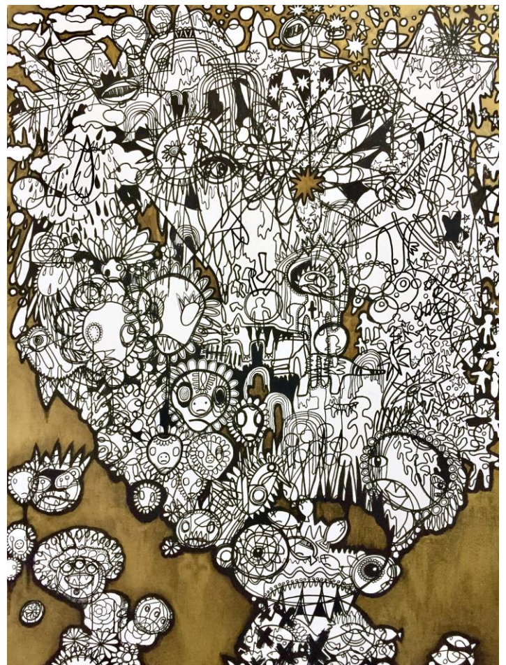
Shen Li Khong, space 351