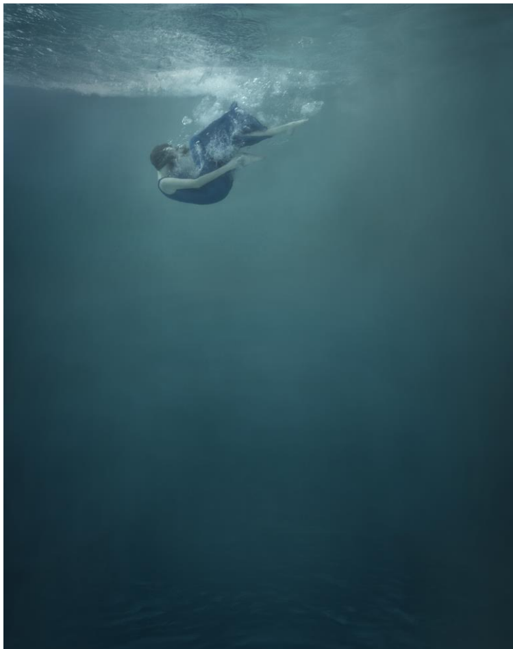
Underwater photographer Mallory Morrison, space 236