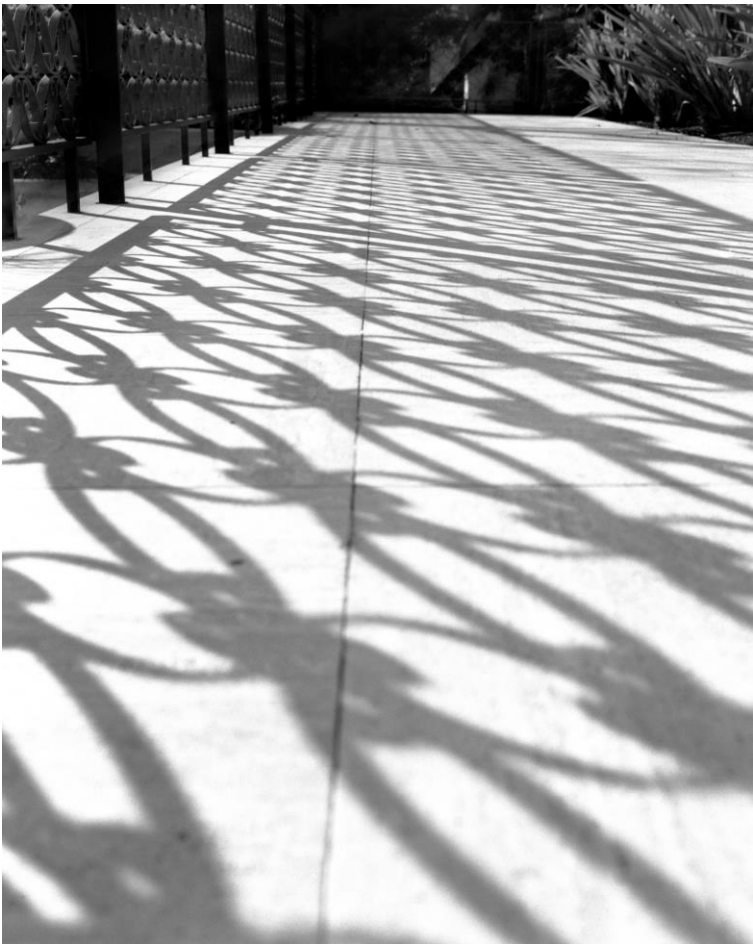
Marshall Vanderhoof, photographer of dramatic and occasionally noir Southern California cityscapes. Space 343