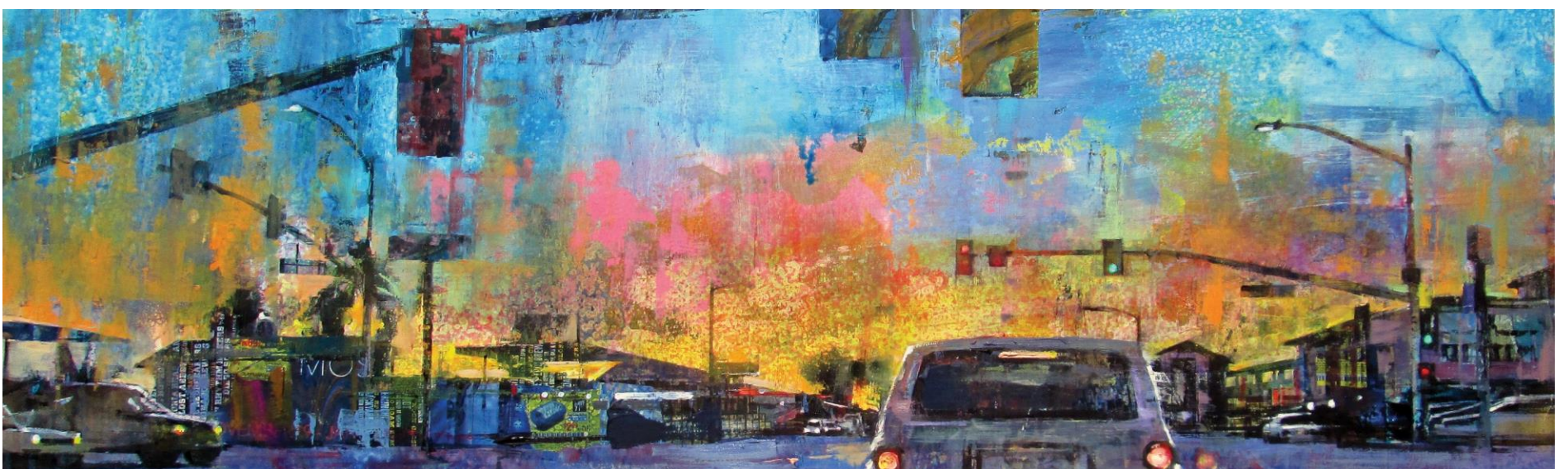
Ivano Stocco, mixed media painter of Los Angeles' long alleys and streets. Space 160